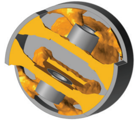
Ideal piston concept generated in solidThinking Inspire