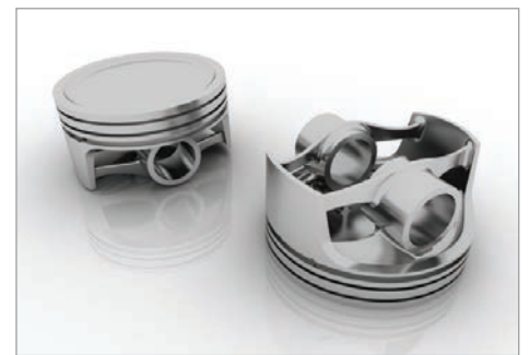
Final rendering of piston in solidThinking Evolve prior to manufacturing